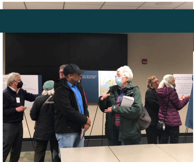
Photos from the first open house held on April 26, 2022